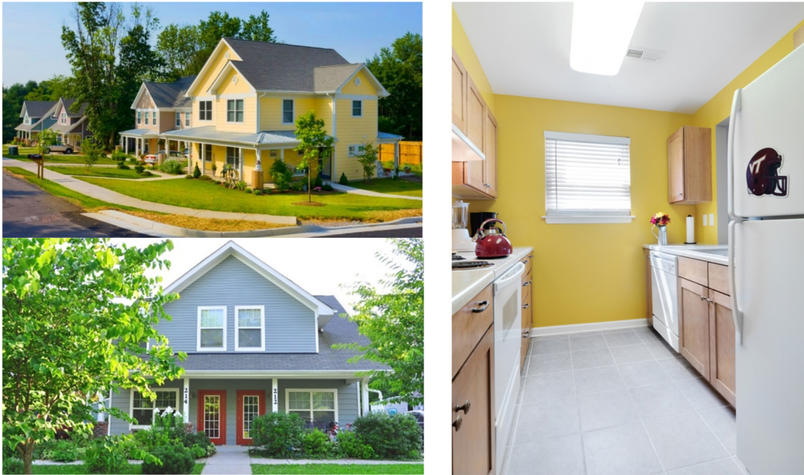
FIGURE 2. Typical RLS duplexes.

NeighborWorks American-Home Depot, Enterprise Green Communities, the Housing Assistance Council (HAC) Green Fund, and the HAC Self-Help Homeownership Opportunity Program (SHOP). The project team also arranged below market rate financing from the Federation of Appalachian Housing Enterprises and other loan agencies to lower the cost of the construction loans and thus increase affordability for the eventual homebuyers. The total budget for the 9 two-bedroom units and 5 three-bedroom units, ranging in size from 1,001 sf to 1,317 sf, was $3.3 million. To further offset the cost of the project, the project team raised an additional $823,175, 25 % of the total, from the following sources: