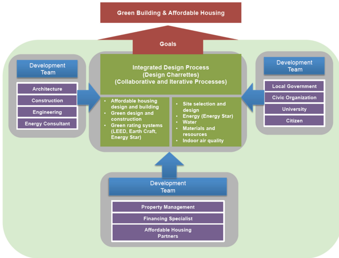
FIGURE 10. Green affordable development framework.

building and affordable housing is shown in Figure 10. One of the most important factors contributing to the success of GAH in this project was the implementation of an integrated design process that involved all the stakeholders working together to achieve these goals. The use of this type of integrated design process also optimizes all the systems in the project, thus minimizing the initial cost premiums and lowering operation costs once the house is occupied. The project team conducted a comprehensive study to identify and apply for as many grants and incentives as possible related to affordable green building housing development. Finally, the project team developed an operation and maintenance manual covering all the project's green features to help the occupants operate and maintain their new properties and provided a training and education session at the housing hand over stage.