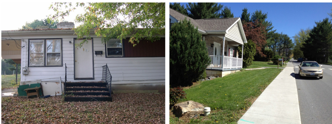
FIGURE 9. Neighborhood development.

This project was initiated as part of the Roanoke-Lee Street neighborhood development project, which was designed to improve this historic neighborhood close to the town center. From being a rough and undesirable neighborhood with deteriorating housing stock and infrastructure, the project aimed to create a vibrant and vital community by improving public utilities, roads and sidewalks; rehabilitating 7 owner-occupied homes and 10 renter-occupied homes; and substantially reconstructing another 3 homes in addition to the 14 new duplexes (Figure 9). As part of this overall development, the GAH project made synergic effects to