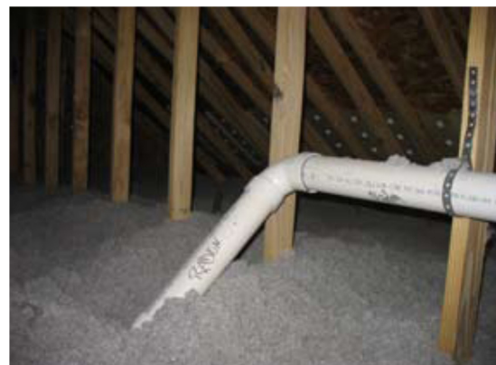
FIGURE 5. Improved ceiling insulation to R-38.

Commissioning for the homes was performed as part of the Energy Star Certification process, including energy modeling, ductwork and building envelop testing, and HVAC system testing. Residential Energy Service Network (RESNET) certified staff performed pre-occupancy tests, including dust sealing and post construction blower door tests, to confirm that the building envelope’s air leakage characteristics were satisfactory (Figure 5). Figure 6 shows the results for one of the project buildings. All the buildings were found to exceed the Home Energy Rating System (HERS) targets with an average score of 75, and were therefore awarded five Energy Stars by the Energy Star rating system developed and implemented by US Environmental Protection Agency and US Department of Energy. Based on its home energy-rating certificate, the house described in Figure 6 consumed 8.9 MMBtu for heating, 1.8 MMBtu for cooling, 10.6 MMBtu for hot water, and 13.8 MMBtu for lights and appliances.