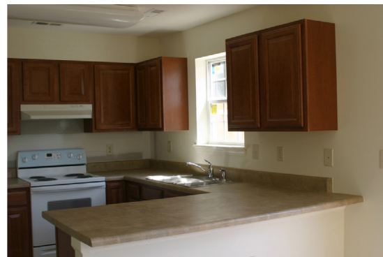
FIGURE 8. Daylighting provides an attractive indoor environment.

To provide a healthier indoor environment, low VOC paints, primers, adhesives, caulks, and sealants were used throughout. Hardwood flooring and ceramic tiles were installed as an alternative to carpet or PVC flooring to reduce off-gassing and enhance durability. Each house was designed to introduce sufficient daylight to create a warm and inviting indoor environment (Figure 8).