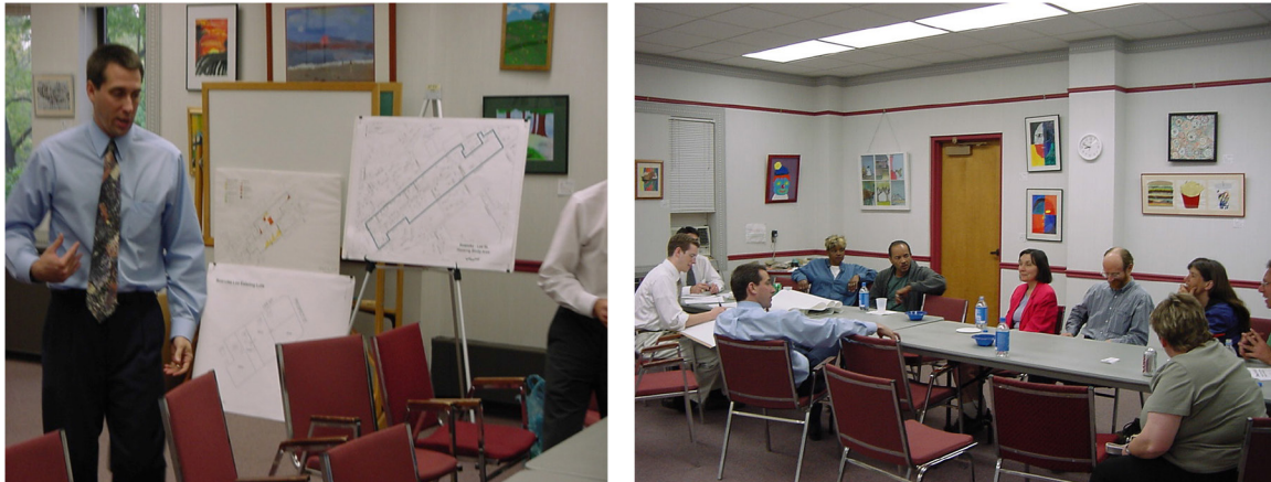
FIGURE 3. Integrated design meeting (charrette) for green affordable housing.

private-public partnership. At the design charrettes, the project team identified green strategies that were applicable to the project; defined the strategies that could be applied to offset the first cost premium of each of these strategies; explored the impact of the new development on the neighborhood as a whole; and discussed who would be the potential buyers of the houses. In addition, the project team members attempted to lower the initial cost premium of green features through advanced framing techniques, choosing the smallest possible heating, ventilating and air conditioning (HVAC) equipment using a recognized building energy software tool, conducted a life-cycle cost analysis (LCCA) for specific green materials and systems, and so on.