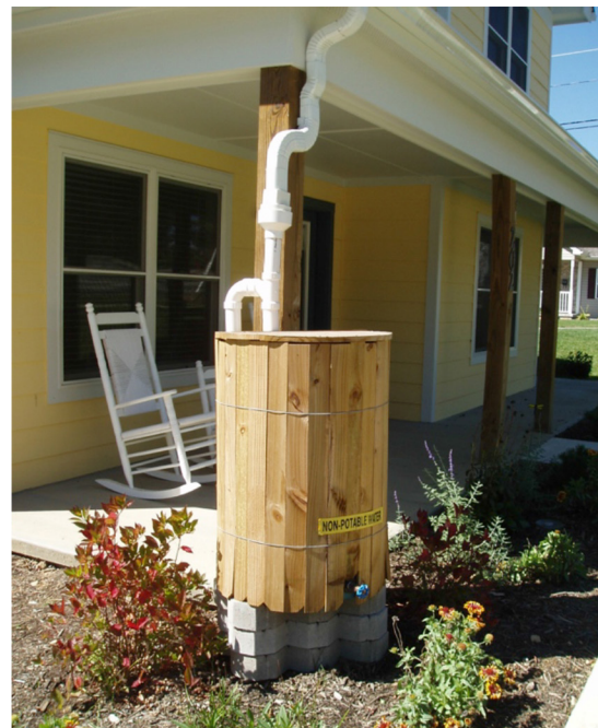
FIGURE 7. Rain barrel for irrigation.

To improve water efficiency, all water fixtures in the units were low-flow, water-conserving fixtures. Dual flush toilets, low flow faucets and showerheads, Energy Star clothes washers and dishwashers, rain barrels and rain gardens were installed in all the project duplexes (Figure 7). The water saving strategies and technologies incorporated made it possible to minimize the use of potable water, thus reducing both the cost to the homeowner and the burden on municipal water supply and wastewater systems. The project team also planted native trees and vegetables that required little or no irrigation, thus not only further reducing the use of potable water but also providing valuable habitat for the local wildlife and promoting bio diversity.