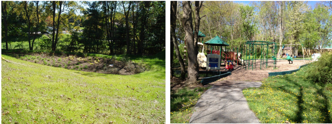
FIGURE 4. Rain garden and recreation park.

building was predicted using the “Residential Energy Analysis and Rating Software V12.32” package developed by Architectural Energy Corporation in Boulder, Colorado. The integrated energy saving strategies were predicted to result in a 33% reduction in electricity usage for an average unit in the first year of occupancy (11,286 kWh versus 16,856 kWh for a typical new home of the same size based on predicted results by the Energy Star Certification by the US Environmental Protection Agency (USEPA)). All external lights were fitted with daylight sensors in order to shut off automatically during the daytime. To improve energy efficiency and optimize the size of the HVAC system, building energy software was utilized to determine the smallest heating, ventilation and air conditioning equipment needed for each unit. Choosing and installing the optimal size of HVAC system should reduce both the initial cost of a high efficiency HVAC system and the subsequent operation costs once the occupants move in.