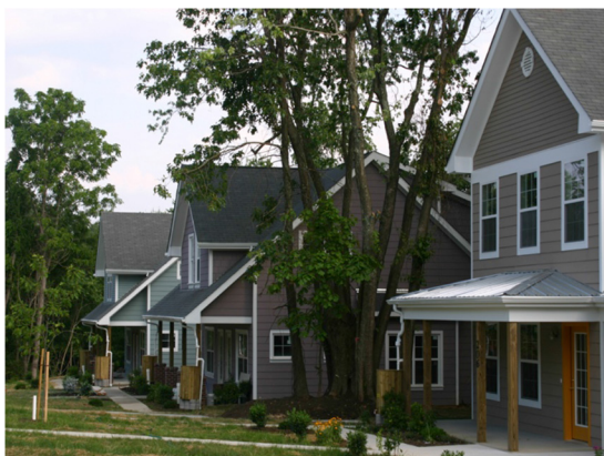
FIGURE 1. Roanoke and Lee Street housing project description.

As this project was a public and private partnership development designed to support the dual goals of affordability and green building, the town of Blacksburg and CHP both played significant roles throughout the housing development process, from management to construction, marketing and financing. In order to provide affordable housing for low and moderate income first home buyers, the project team secured funding from the Blacksburg Community Development Block Grant, the Virginia Department of Housing & Community Development,