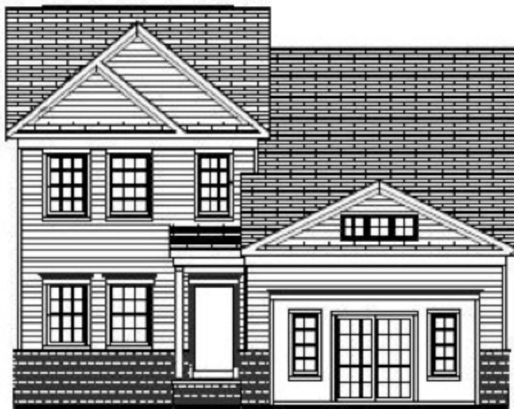
FIGURE 1. Rendering of Completed Net-Zero Energy Home. [Adapted from S&A Homes (2010)]

Several alterations were made to the mechanical systems in the NZE home when compared with a traditional home. The HVAC system was optimized to provide the highest levels of energy efficiency, comfort, and air quality. The primary source of heating is an electric