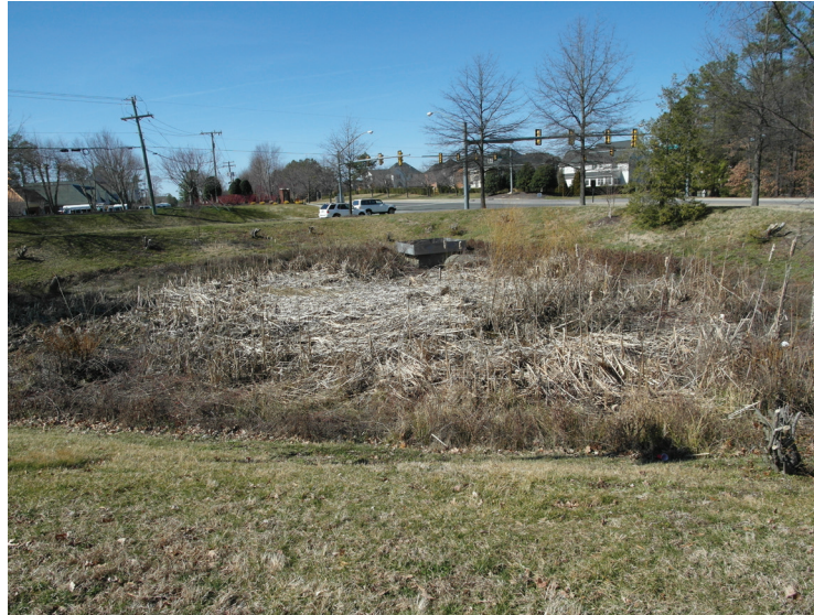
FIGURE 7. Wet ponds (retention basins) provide more stormwater treatment than detention basins since a volume of water is held until the next storm replaces it. However, the absence of emergent macrophytes or submerged plants reduces the treatment effectiveness dramatically. (Mosberg, Glen Allen, Virginia, 2012).

FIGURE 6. In contrast to wet ponds, bioretention basins require a sedimentation forebay or a nearly flat turf slope to intercept sediment and suspended solids to prevent clogging of the infiltration surface. (Mosberg, Glen Allen, Virginia, 2012).