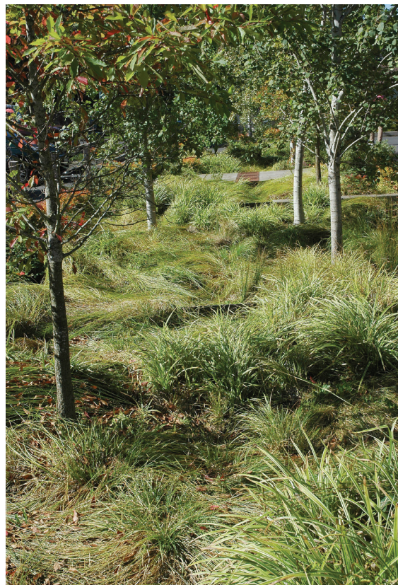
FIGURE 5. A sequence of bioinfiltration basins separated by check dams clean water from a school parking lot (Austin 2011).

Bioretention basins can be positive contributors to the aesthetics and biodiversity of cities if native plants are used thoughtfully (Figure 5). Achieving these secondary benefits is important for acceptance by the homeowner or developer. Bioretention basins are effective landscapes for the treatment of pollutants, stormwater management and groundwater recharge. The basin design must be adapted to site conditions and the primary implementation goal, but are more effective than stormwater detention and retention basins (Figure 7). Lower than desired removal of nitrates, phosphorus, and chloride require design modification or additional treatment methods. Use of a saturated volume within the bioretention basin improves nitrate removal. Even higher performance might be achieved (as it is in the treatment of wastewater) if a sequence of treatment stages is implemented (Langergraber, 2009). This might be configured as a lined aerobic bioretention basin followed by a lined anaerobic horizontal subsurface wetland and then an infiltration bed (Austin, 2010).