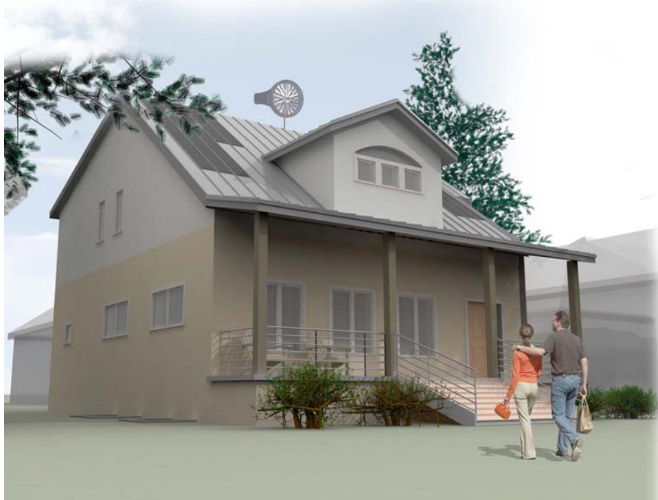
FIGURE 1. Final ZNETH design.