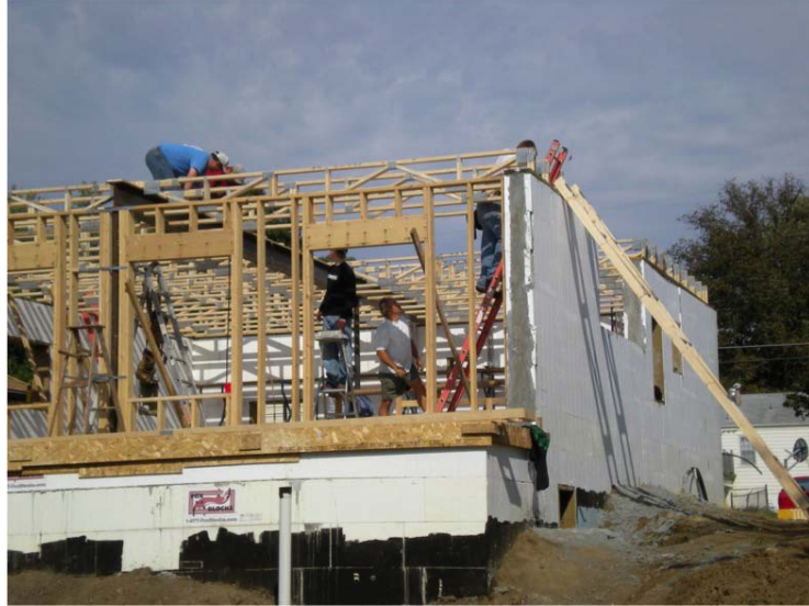
FIGURE 2. Students working on ZNETH.

other alternatives (EMEGA Biopolymers, 2010). Typical residential construction is wood framed 2 by 4 walls. Typical fiberglass insulation in the three and a half inch cavity provides an R-value of 11. Open cell soy based insulation in the same space provides an R-value of 12.6 or R3.6/inch. The equivalent space using closed cell would provide an R-value of 23.8 or R6.8/inch. This results in an R37.4 for the 2 by 6 walls using closed cell insulation. In addition, the closed cell provides some additional structural support that allows 24" spacing between studs reducing the amount of wood in the structure.