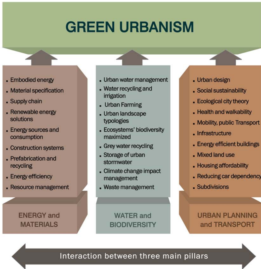
FIGURE 1. The three pillars of Green Urbanism, and the interaction between these pillars. Diagram by Steffen Lehmann, 2006.

on. It is an approach to urban design that requires an optimization process and a solid understanding of the development's wider context and its many dimensions before the designer can produce an effective design outcome.