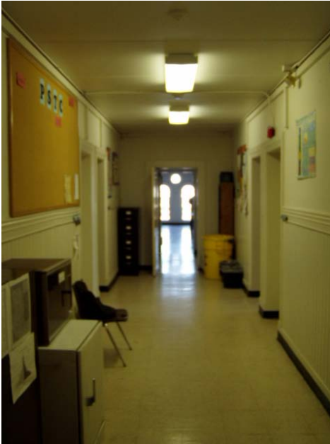
FIGURE 9. College dorm as offices before.