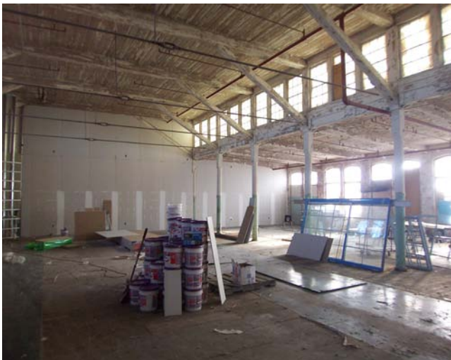
FIGURE 11. Mill building monitor before.