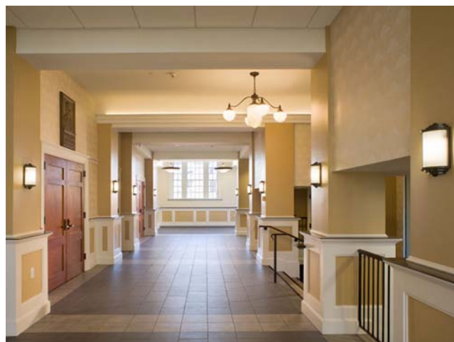
FIGURE 6. 1910 lobby restored.

brane roof system designed to receive solar PV film in the future. Daylighting of the hallways was introduced with Solatubes not visible from the exterior. Similarly, although new windows would have helped another older historic masonry parochial school project of ours, funding for a new boiler was all that was available. Replacement with dual high efficiency units and a shift from oil to natural gas fuel reduced heating costs at the school by 30%.