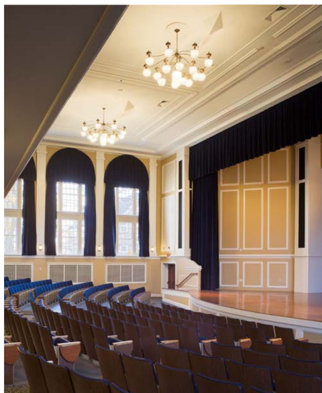
FIGURE 13. Deco chandeliers replaced wagonwheels of can lights.

Progress in lighting allows retrofit and custom fixture designs for historic venues that can satisfy both energy-efficiency and aesthetics. At URI, we replaced 1960s can lights with custom warm-fluorescent chandeliers of deco/arts and crafts lineage more appropriate to this 1910 granite edifice. The new sconces in the building maintain an early deco theatre theme, still meet energy and ADA requirements, and were amended only slightly from stock fixtures (Fig. 13 and 14). Where new codes mandated new types of lighting for this renovation, such as performance lighting for safety path visibility, advanced LED technologies were employed to install low-profile carpet runner edge and stair nosing applications in an incredibly energy-efficient system.