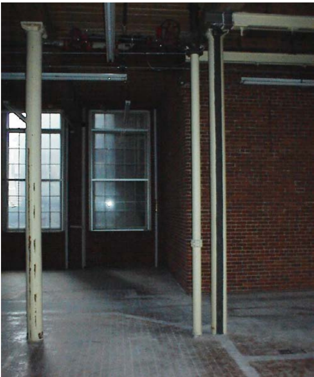
FIGURE 2. Downtown factory before.