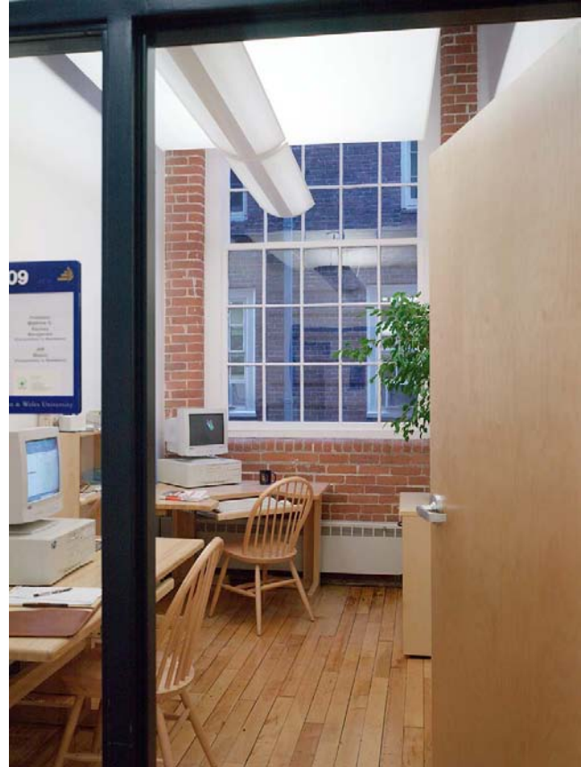
FIGURE 15. Office with acoustic cloud.

intrinsically very "green." Linoleum, for example, is a natural replacement now for its own prior "improved" replacement, vinyl composition tile. This older flooring is new again, made of post-industrial sawdust and linseed oil but reinforced with recycled glass fiber backing as tile in wonderful colors. Improvements on older materials also abound without sacrificing aesthetics. Carpets would have been wool (and can be again on a large enough budget), but recycled and recyclable nylon and polypropylene also serve well. Millwork once done in mahogany can now be replicated in low-VOC, non-formaldehyde MDF. Slate sills and thresholds can become recycled-content solid acrylic, and wallpaper can be used that is both rapidly renewable, flame-retardant, and breathable to help those historic walls (Fig. 14).