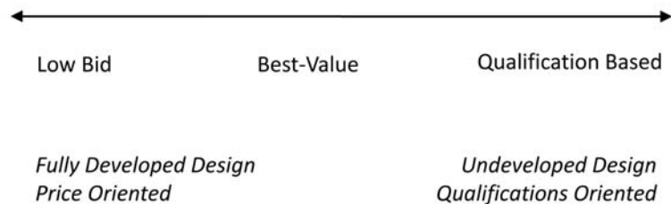
FIGURE 2. Procurement Methods.

As the design-build concept utilizing a best-value procurement strategy began to proliferate, so did studies on its performance. One study comparing