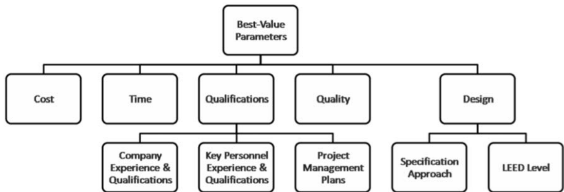
FIGURE 3. Content Analysis Categories and Subcategories.

LEED levels rewarded through procurement, LEED level set at procurement, and LEED level unspecified at procurement. Several solicitation documents mandated explicit LEED points or sustainable objectives to be met. Others were either silent on the topic or presented “suggested” points that were contractually superseded by a performance specification regarding the required LEED certification level to be achieved. Three subcategories were used to delineate differences in this area: specific LEED points required, specific LEED points discussed, and no discussion of LEED points. The incorporation of LEED requirements and submittals into a project management plan was also found to vary. Three subcategories were developed accordingly: management plans required that include LEED objectives, management plans that do not include LEED objectives, and no project management plan required. Figure 3 shows the categories and subcategories that emerged from the content analysis approach. The remainder of this paper discusses the results from this categorization system.