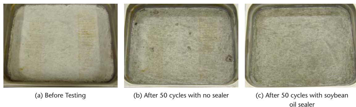
FIGURE 3. Baseline Concrete Mixture Deicer Testing Results.

The primary consideration for increased recycled content in structural concrete is the slower strength gain compared to 100% Portland cement mixtures. The extra time required to achieved the specified compressive strength may not be appropriate for projects under a short timeframe. However, knowing that the higher recycled material concrete will require longer curing time can be built into the project in the planning stages. Precast concrete is an