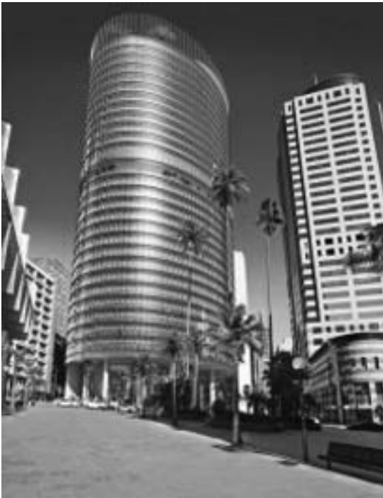
FIGURES 4–8. Images of the new green high rise in Sydney: “Space”, the first 6-star Green Star rated high rise tower, now under construction.