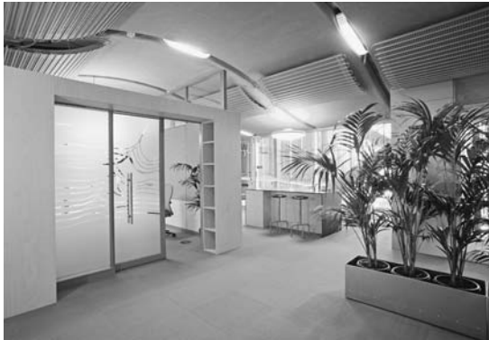
FIGURE 5. Council House 2 (CH2), Melbourne Victoria, materials have been minimised by eliminating secondary ceiling finishes using undulating precast concrete beams and chilled beam thermal control systems. Storage systems double as wall systems, reducing material quantities.(Designers DesignInc).