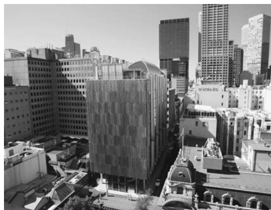
FIGURE 4. Council House 2 (CH2), Melbourne Victoria, the new council building for the City of Melbourne is a 6 Star Green Star rated building with the Australian Green Building Council, the highest rating available in Australia (Designers DesignInc).