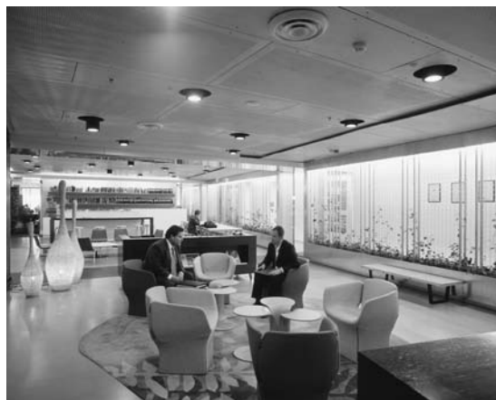
FIGURE 12. Office Fitout for Sustainability Victoria, minimal material usage, reducing product with formaldehyde content and the use of planting to improve indoor air quality and double as dividing screens (Designers Hassell).