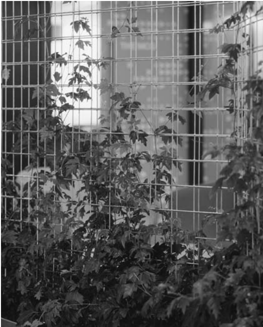
FIGURE 10. Office Fitout for Sustainability Victoria, the use of planting to improve indoor air quality and double as dividing screens (Designers Hassell, Photographer Trevor Mein).