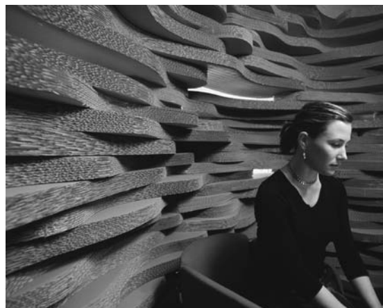
FIGURE 9. Office Fitout for Sustainability Victoria, breakout space uses cardboard, a biodegradable or recyclable material, as a dividing wall (Designers Hassell, Photographer Trevor Mein).

While the selection of materials and products for interiors based on their own life cycle processes is vital to the success of a sustainable interior fitout, so is the