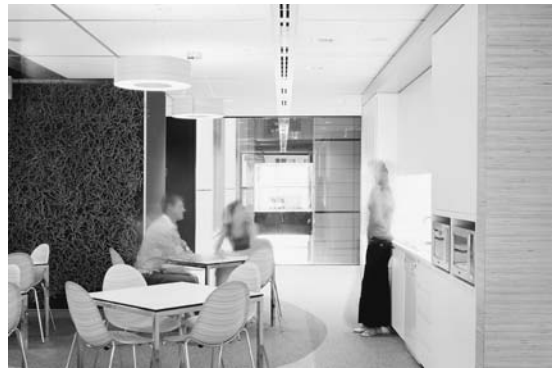
FIGURE 11. Office fitout for Investa Property Group, break out area uses FSC (Forest Stewardship Certified) timber products and a linoleum floor to minimise the VOC emissions including formaldehyde (Designers Hassell,)

VOCs. This procedure is, however, energy intensive and the VOCs are just released into the external atmosphere instead and should be a last resort technique in reducing VOCs. Another solution to already problem areas is the use of plants that can reduce the level of VOCs in the internal environment. Recent research at the University of Technology Sydney has indicated that plants can remove certain problematic toxins.