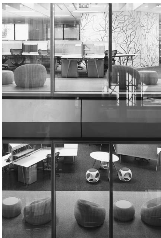
FIGURE 2. 5 Star Green Star Rated (Australian Green Building Council) office fitout for Investa Property Group (Designers Hassell).

Leasing options. With such a high and frequent turnover the ownership of physical items for commercial interiors also comes into question. Alternatives such as leasing options can therefore be considered. This can place the responsibility of end-of-life options back onto the producer to deal with reuse, recycling, and biodegradability. While leasing furniture