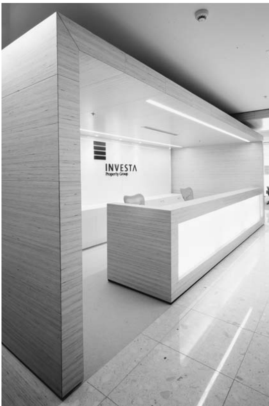
FIGURE 8. Office fitout for Investa Property Group, reception area uses FSC (Forest Stewardship Certified) timber products and reconstituted stone floor which has been integrated into the raised floor panel system for ease of reuse at end of the current fitouts life cycle (Designers Hassell).

Modular, flexible products are generally more available than in domestic interiors that can also be simply and efficiently upgraded and refurbished without the need to replace the whole item. Modular flooring systems, carpet tiles, office chairs, workstations, ceiling panels, modular display units are all products and materials designed for flexibility and control available for the commercial interior industry.