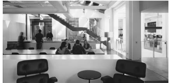
FIGURE 7. Council House 2, Melbourne Victoria low height, open plan workstation layout provides flexibility and reduces materials use. Carpet floor tiles also facilitate flexibility, reuse, and possible recycling (Photographer David Hannah).

FIGURE 6. Hassell Studio, Melbourne, circulation, meeting, and breakout spaces are all integrated into one open plan area. The space also makes use of iconic furniture such as the Herman Miller Eames Lounge Chairs, which should retain their value and therefore use over many years (Designers Hassell, Photographer Earl Carter).