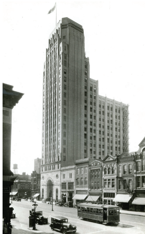
FIGURE 7: Broad Street Tower View from Northwest. c.1938.

The upper stories of the tower façade are marked by vertical strips of windows and brick pilasters with decorative brick panels used to separate the windows horizontally. The brick pilasters soar upward into the sky until they reach their termination as pinnacles against the uppermost two floors of the building, crowned by an ornamental band of brick in a diamond pattern. As it approaches the sky, the building steps back in a ziggurat type configuration found on many Art Deco skyscrapers.