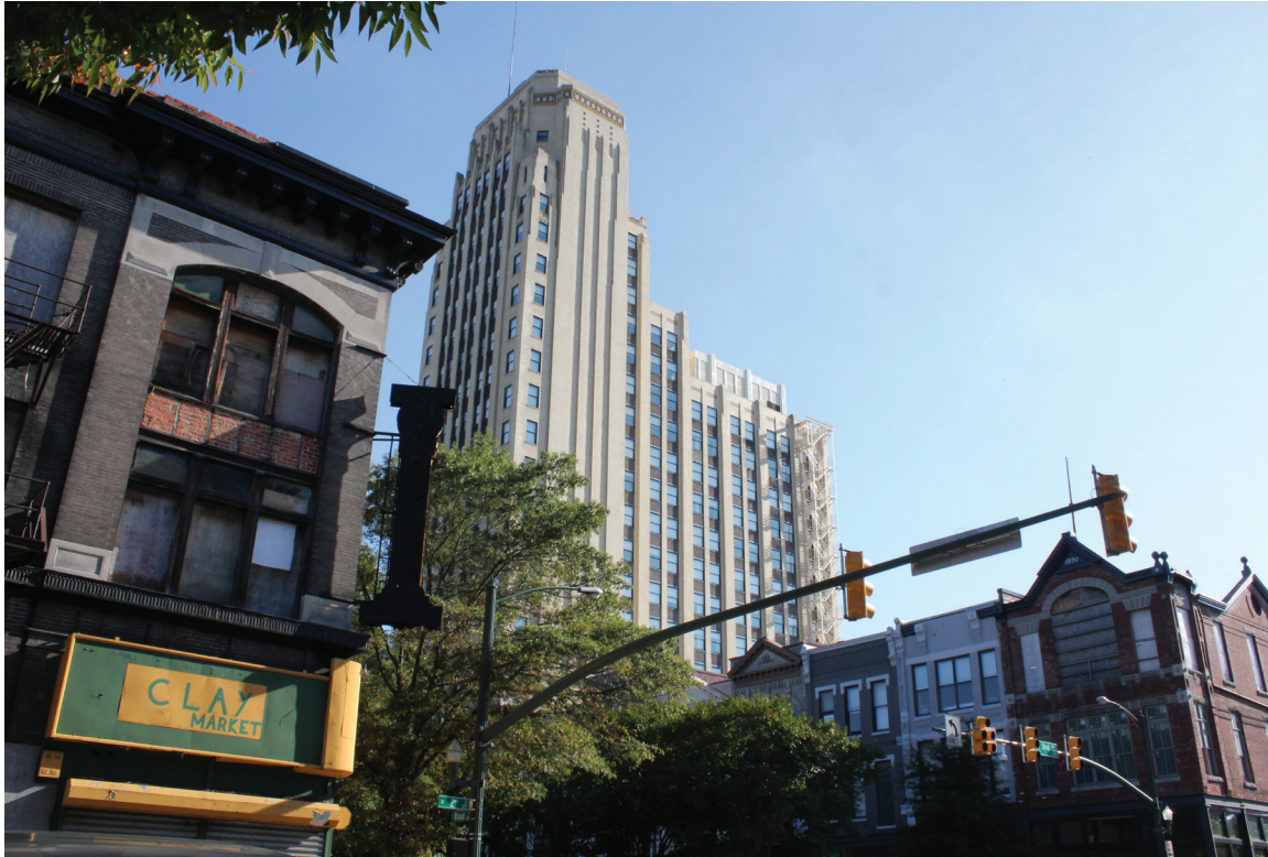
FIGURE 15: The CNB Building today with neighbors awaiting rehabilitation.

best way to incorporate the best of both the historic and sustainable approaches into a cohesive and holistic design that is environmentally, socially and fiscally responsible. As with any project, it should be understood at the outset that not all sustainable strategies may be available or appropriate and that flexibility on both the historic and sustainable sides is necessary. An integrated design approach offers the best chance for a successful solution. Below are some of the sustainable principles used in the historic rehabilitation of the CNB Building.