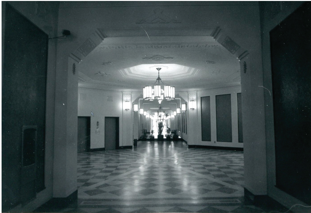
FIGURE 9: Broad-Grace Arcade Interior. c.1978.

The Banking Hall is an even greater example of rich Art Deco design and detailing. A vaulted, three-story space, the Banking Hall includes significant features such as a deeply coffered vaulted ceiling and a geometric patterned terrazzo floor, and makes extensive use of cast bronze for lamps and other furnishings, all designed in the Art Deco style. Arched glass transom windows flank the Banking Hall on the long sides and flood the space in beautiful natural light, giving the Banking Hall a monumental quality.