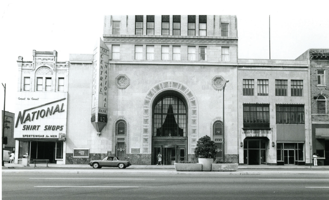
FIGURE 5: Broad Street Entrance Facade. c.1978.

The main façade fronting on Broad Street is composed of a dominant limestone two-story arched entry with a multi-paned glass transom over a substantial bronze and marble-framed entrance featuring a central revolving door. Carved low-relief voussoirs border the arch to frame the main entrance, which is balanced on either side by lower arched windows that are bordered by their own low-relief carving, this time in a zig-zag pattern. These flanking window openings are protected by ornamental bronze grillwork. We can see that every aspect of the careful and sober design of the building entrance, from the selection of sturdy limestone as the dominant material to the use of symmetry as a compositional theme, is crafted to provide a sense of strength and stability for the new bank.