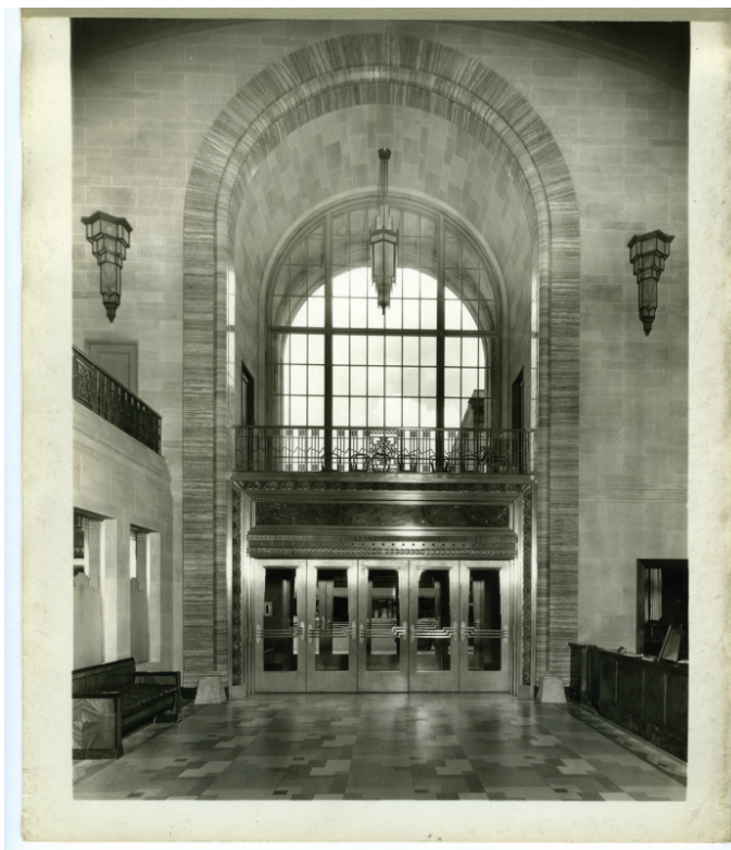
FIGURE 11: View to Broad Street Entrance from Banking Hall, undated. ©Wolfsonian P180213.