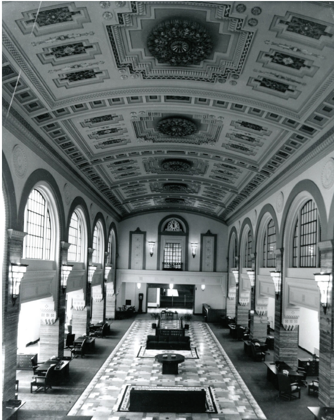
FIGURE 10: Banking Hall. c. 1930.