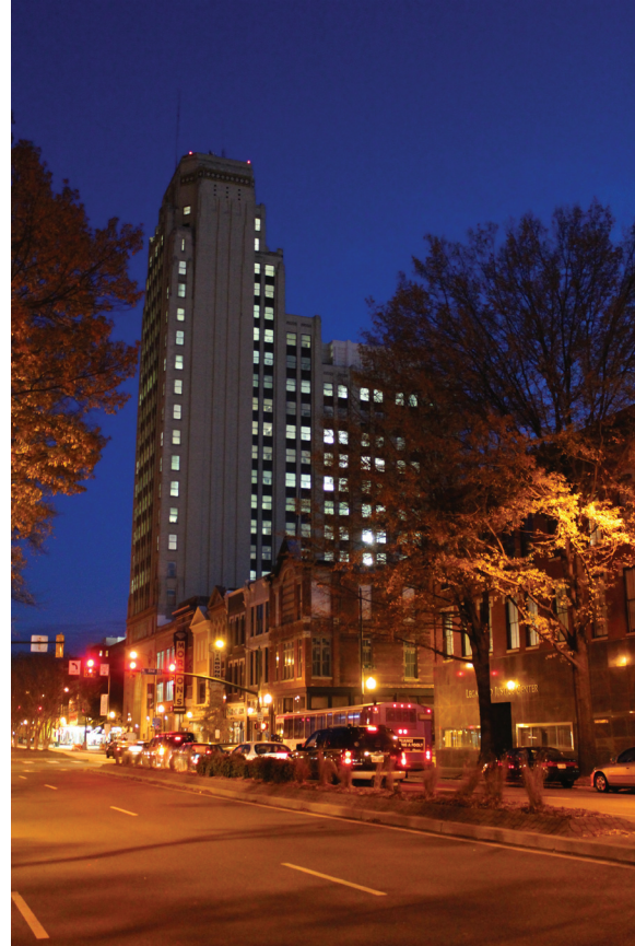
FIGURE 18: The Central National Bank Building, 2016.

the true test of the level of success that we are able to achieve. Likewise, how well the CNB Building fulfills its goal of catalyzing the revitalization of its surrounding neighborhood also remains to be seen. The building is completely immersed in its neighborhood and intrinsically linked to the neighborhood's success. Success or failure will be borne out only by future projects and their own successes. We look forward to performing this analysis when the time comes, so that the case study of the Central National Bank Building rehabilitation project can be concluded and the effectiveness of our approach for future projects can be validated. Ongoing evaluation, validation and adjustment of our approach are a continuous process.