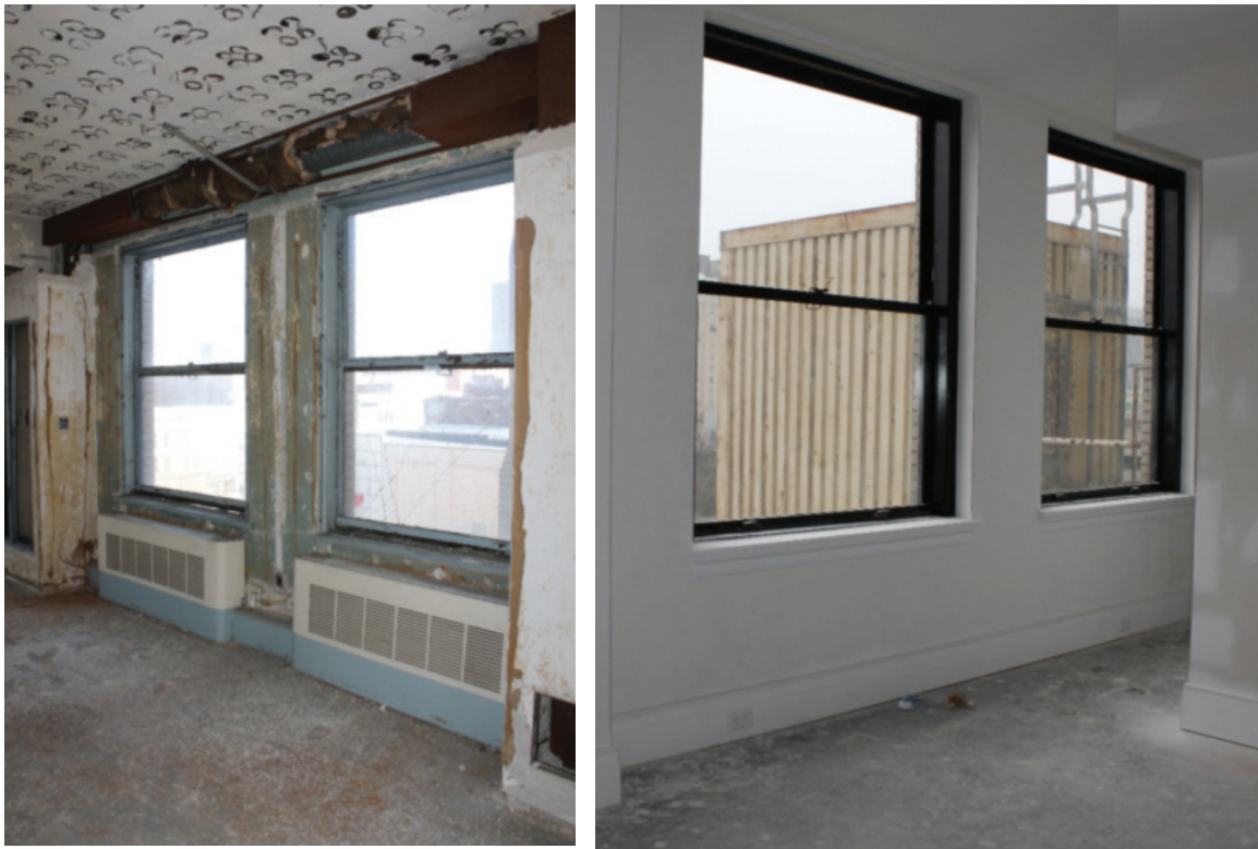
FIGURE 16: Before and after photographs of historic plaster walls in the Tower. After photo shows refurbished plaster and steel windows with “invisible” insulating interior storm units.