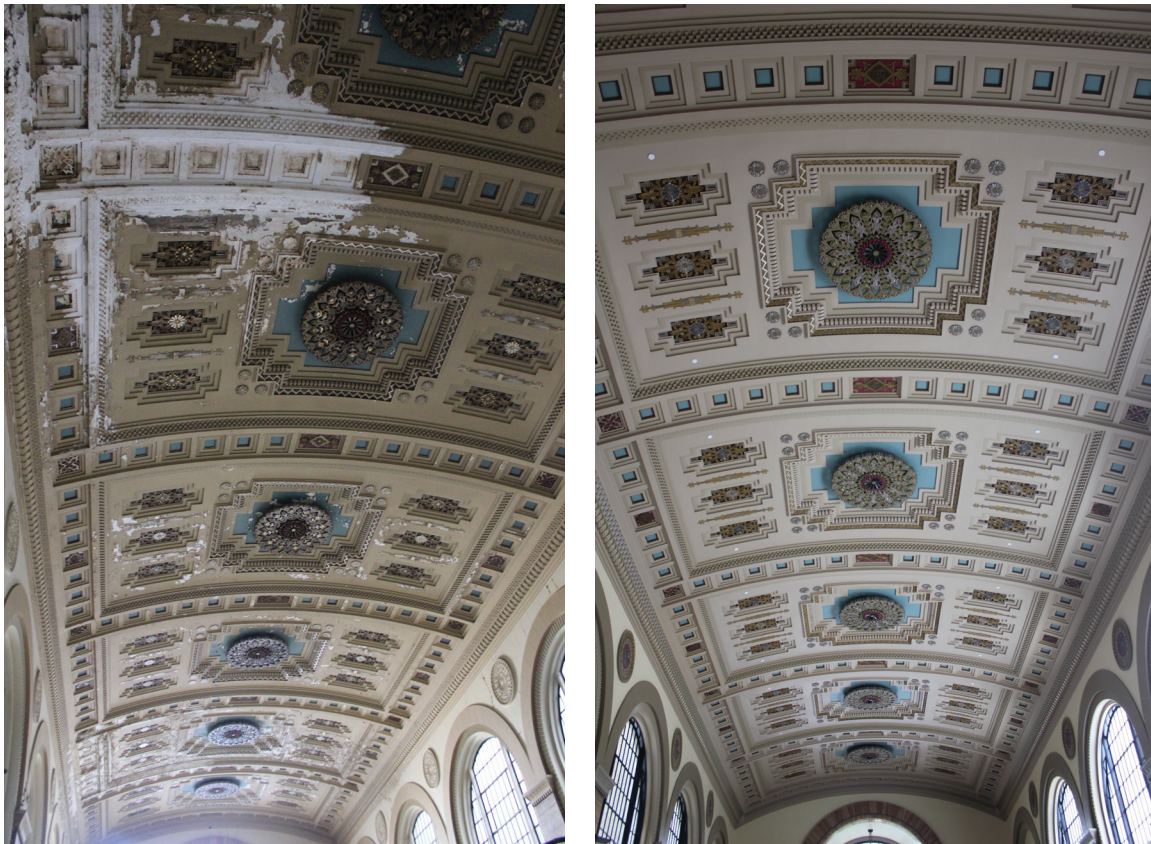
FIGURE 12: Before and After photographs of the vaulted ceiling of the Banking Hall. After photo shows the restored plaster detailing and historically accurate color scheme.

The restored Banking Hall, now returned to its original splendor of rich colors and Art Deco appointments, will become a restaurant with garden seating, currently scheduled for completion in the Fall of 2017. Future plans still include construction of a pool and spa area on the fourth floor roof of the annex, along with an outdoor lounge space for residents. All new work on the project is intended to be true to the original design intent of John Eberson.