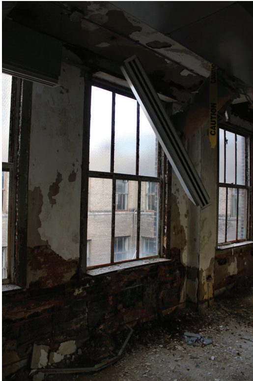
FIGURE 17: Before and after photos of Annex walls w/ insulated metal stud and gypsum board furring and refurbished steel windows