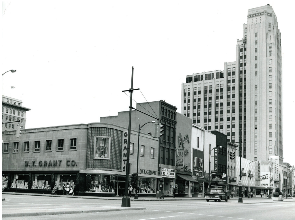
FIGURE 13: Broad Street, c. 1964.

"The health of downtown depends upon people living and working in the district, enhancing opportunities for restaurants, stores and events that weave together a community."