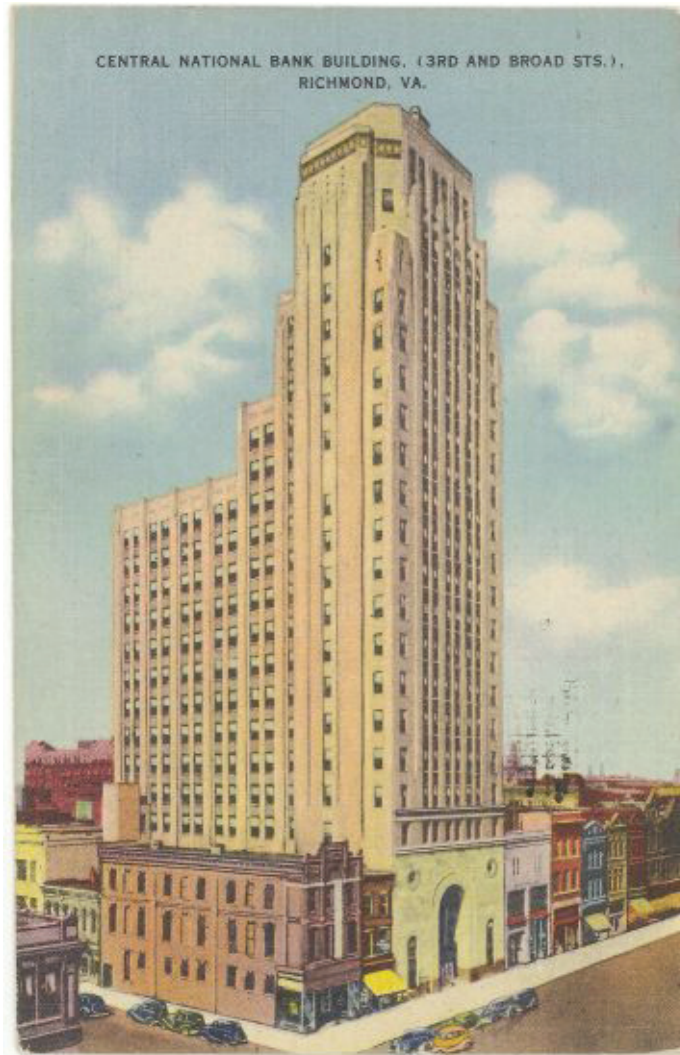
FIGURE 1: View from the corner of Third and Broad Streets, Richmond, VA, toward the Central National Bank Building. Post card c.1930s.

The Central National Bank was an immediate success. By the spring of 1912, deposits totaled in excess of $500,000 and on November 2, 1914, the bank became a charter member of the Federal Reserve Bank System, which was incidentally two weeks before the Richmond Federal Reserve Bank opened. By 1921 the bank had grown to become the sixth largest bank in Richmond.