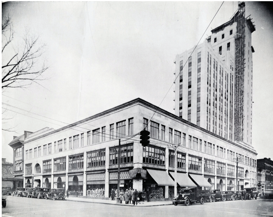
FIGURE 8: Broad-Grace Arcade viewed from the corner of Grace and 3rd Streets. c.1938.

The original First Floor plan of the Arcade included a continuous hall connecting the public entrances and extending from Broad Street to Grace Street. Fronting on this hall were individual shops that provided retail amenities of different types. It is perhaps ironic that the success of the banking business over time necessitated the removal of the retail shops for an expansion of the banking operations, as well as the addition of the fourth floor.